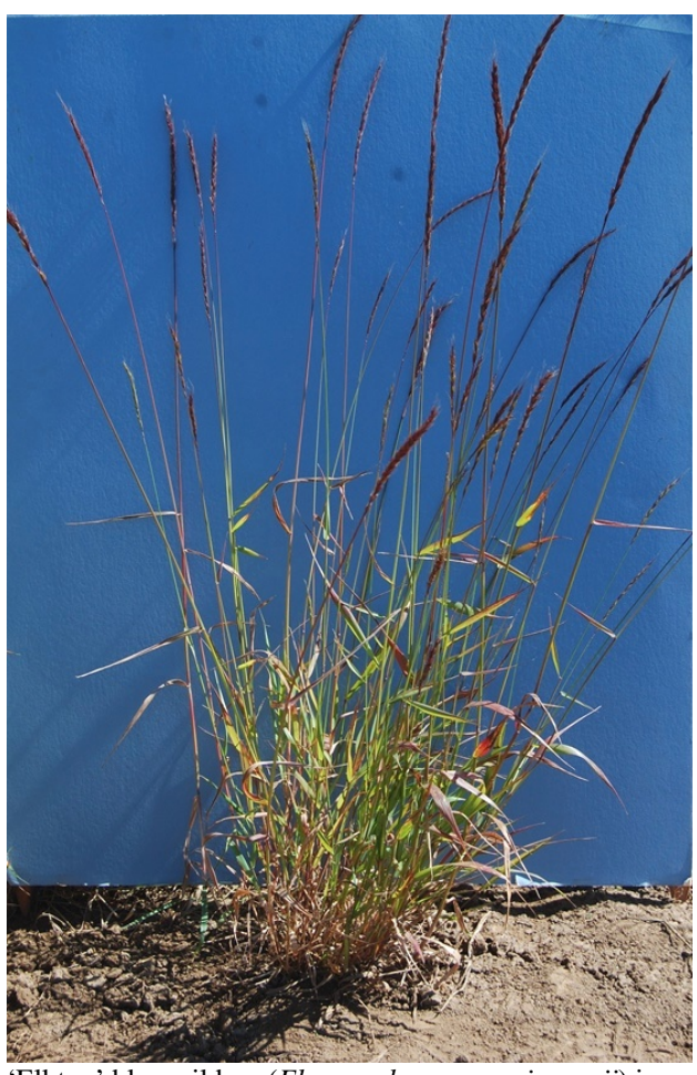
'Elkton' blue wildrye ( Elymus glaucus ssp. jepsonii ) is a grass cultivar released in 1997 in cooperation with the Oregon Agricultural Experiment Station. It is intended for conservation use in western Oregon and northwestern California.

A Conservation Plant Release by USDA NRCS Corvallis Plant Materials Center, Corvallis, Oregon